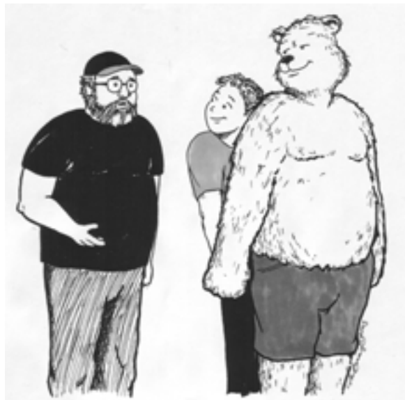
“When you said you were into bears, I never took it quite that literally...”