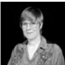
Lois McMaster Bujold

We're proud to announce that Lois McMaster Bujold has agreed to be our Guest of Honor. Lois is an award-winning author with (to date) 4 Hugos, 2 Nebulas, and 2 Locus Awards. Her current novel, Paladin of Souls , is nominated for this year's Best Novel Hugo. LSF members and those who read preferentially off the LSF Recommends list will know her of her novel Ethan of Athos .