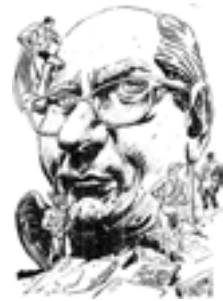
portrait by Joe Kubert, for cover of Amazing World of DC Comics #3 (2001)