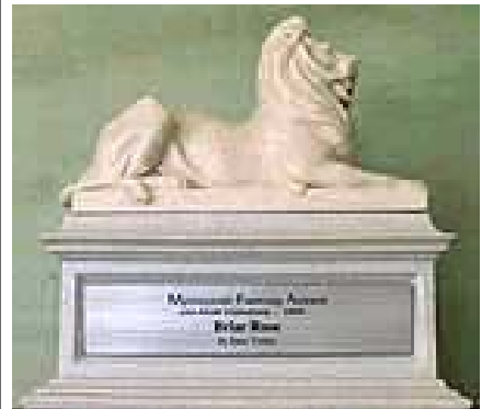
Aslan Award (Mythopoeic Society Award)