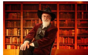
-- Terry Pratchett --

It is often said that before you die your life passes before your eyes. It is in fact true. It’s called living.