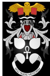
Sir Terry's Coat of Arms

ted an Officer of the Order of the British Empire (for “services to literature”). On February 18, 2009, Sir Terry was knighted by Queen Elizabeth (also “for services to literature”). He later said: “You can’t ask a fantasy writer not to want a knighthood.” He has also been awarded with too many F&SF awards and honorary doctorates to list here – including the World Fantasy Award for Life Achievement (2010).