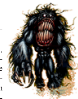
Wendigo, from the RPG Deadlands

A n d , suddenly, it appears that the creature that attacked Cole is on the rampage. Settlers, Indians, and livestock are be-