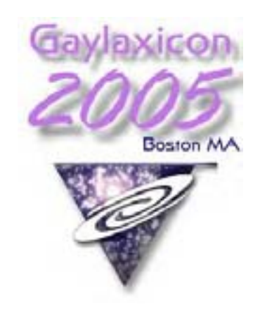
For more details, see Con Calendar on page 6

The main character, Dennis Heller, is a young man with a big problem. OK, so he's an adopted child and his adoptive parents never really had any affection for him — but that's not the problem. While driving in California with his longtime best friend Graham, Dennis is involved in a minor car accident. He wakes up in a small private hospital with no serious injuries; but he subsequently learns that one of his kidnevs has been removed. He also learns that the seemingly innocuous "gall bladder operation" he'd had a few years earlier was actually a cover for removing part of his liver. Here's the big problem — someone seems to be using Dennis as a living/breathing organ bank! In other words, certain of his internal organs are being "harvested" by powerful and mysterious "person or persons unknown"! Who's doing this? Why is this happening to him? And, most