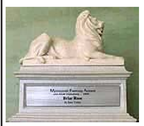
Aslan Award (Mythopoeic Society Award)