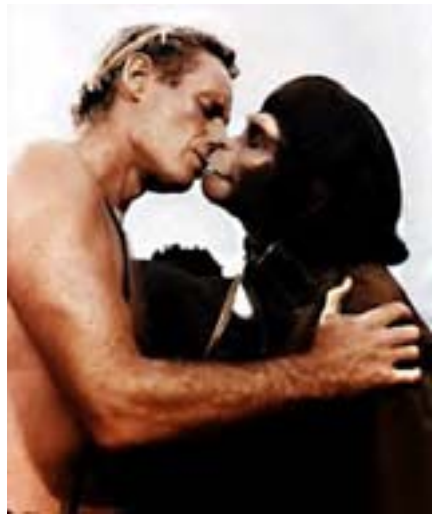
Taylor (Heston) & Zera Planet of the Apes (1968)

Heston served as president of the Screen Actors Guild and chairman of the American Film Institute; and he marched in the civil rights movement of the 1950s. With age, he grew more conservative and campaigned for conservative candidates. In June 1998,