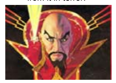
-- Ming the Merciless -- Flash Gordon (1980)

"Pathetic Earthlings! Hurling your bodies out into the void without the slightest inkling of who or what is out here! If you knew anything about the true nature of the universe, anything at all, you would have hidden from it in terror!"