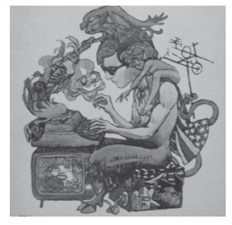
Depiction of Harlan Ellison from the Dillon cover for The Glass Teat

http://leo-and-dianedillon.blogspot.com/