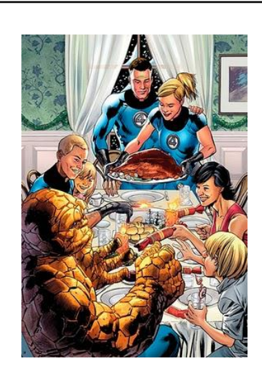
Happy Thanksgiving to all you LSFers out there!!!