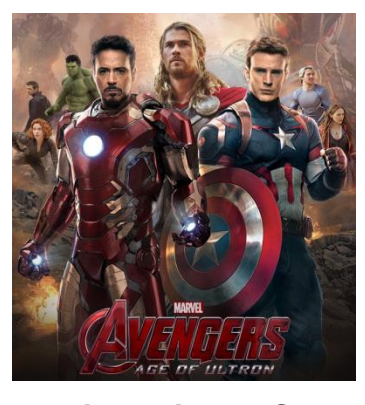
Movie Outing to See Avengers: Age of Ultron