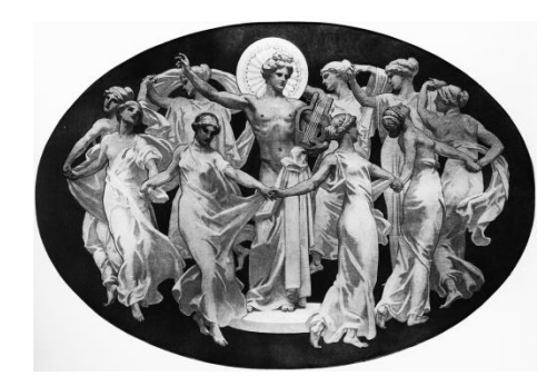
Apollo and the Muses, by Sargent

The novel shifts back and forth in time, alternating between Perenelle's current identity (Camille