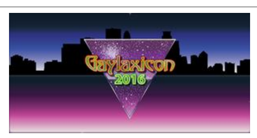
For details, see Con Calendar on page 4.

Per our new meeting format, we concluded with a "group viewing" by showing the first two episodes of the SyFy Channel series The Magicians . Well received; cheers all around.