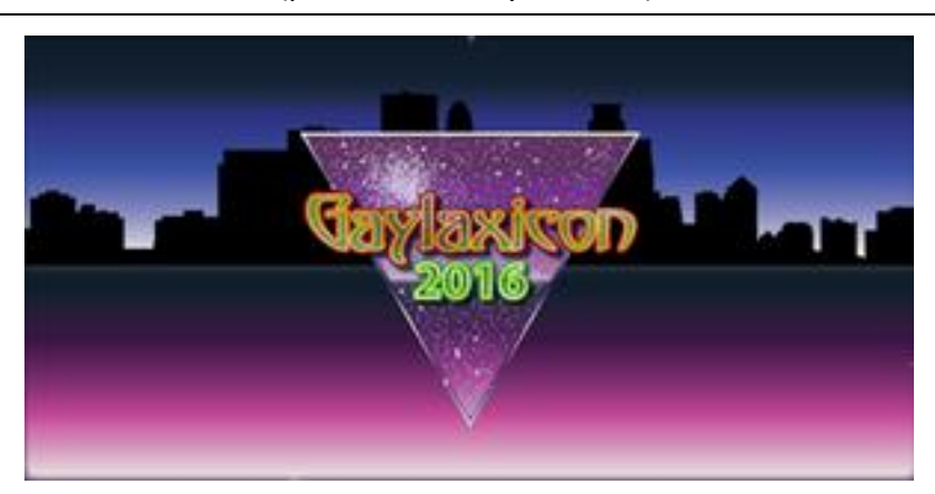
Only 5 months to go! See details on page 4.