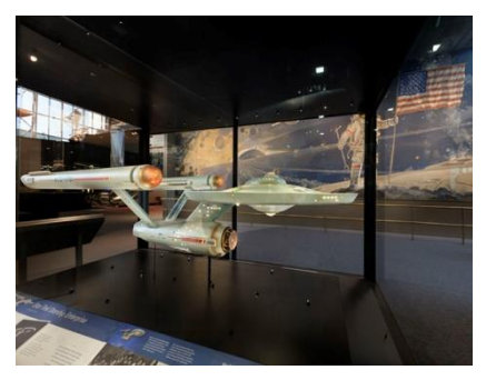
(continued on page 2)

Questions: Contact Peter at: <u>PeterPKnapp@gmail.com</u> or Rob at: <u>RobGatesDC@gmail.com</u> \Lambda\Psi\Phi