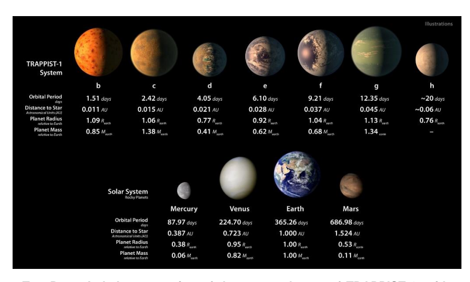
<u>Top Row</u>: Artist's conception of the seven planets of TRAPPIST-1, with their orbital periods, distances from their star, radii, and masses as compared to those of Earth.

TRAPPIST-1 itself is only slightly larger than Jupiter but 84 times as massive; and its temperature is 2550 Kelvin (as compared to our Sun's 5778 Kelvin). The age of the dwarf star is estimated to be at least 500 million years (compared to the Sun's age of 4.6 billion years); but TRAPPIST-1 burns hydrogen very slowly and could "live" for another 10-12 trillion years, whereas it's estimated our Sun will "expire" only a few billion years from now.