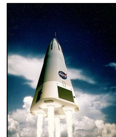
DC-X "Delta Clipper"

Pournelle's advocacy during the Bush years of re-useable single-stage-to-orbit (SSTO) technologies. Many of us had high hopes for the McDonnell Douglas DC-X ("the Delta Clipper") and its kin. < sigh > (By the way, the Delta Clipper makes a "guest appearance" in Fallen Angels .) ΛΨΦ