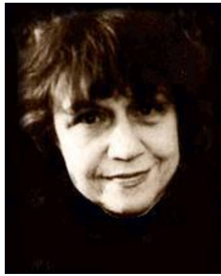
Julian May 1931 – 2017