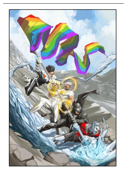
Can you name these gay superheroes?