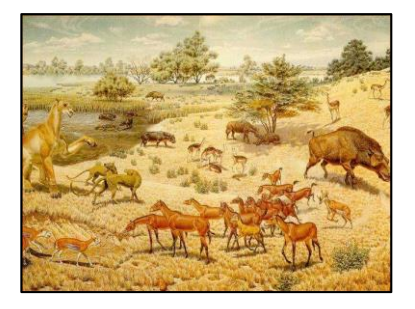
Agate Fossil Beds Mural by Matternes

complete ever found for that species, with missing pieces reconstructed from models.