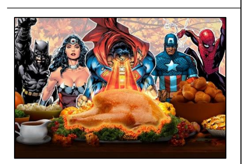
Have a SUPER Thanksgiving!

Finally, we watched the first Star Trek Discovery short feature ("Runaway") and Episode 1 of the new season of Doctor Who.