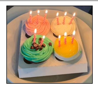
From LSF's 29th Birthday - March 10. 2019 -

Questions: Contact Peter at: PeterPKnapp@gmail.com ΛΨΦ