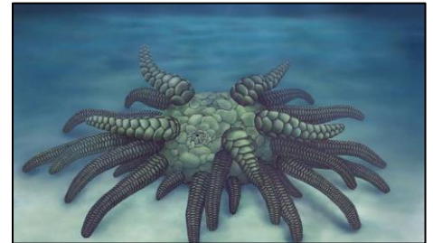
Artist's rendering of Sollasina cthulhu

The research team named this new species Sollasina cthulhu .