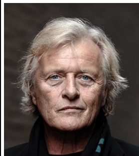
Rutger Hauer 1944 – 2019

In the film Bladerunner , the replicant Roy Batty died in November 2019. Rutger Hauer, the actor who portrayed Roy Batty, almost made it to that date – he passed away on July 19, 2019.