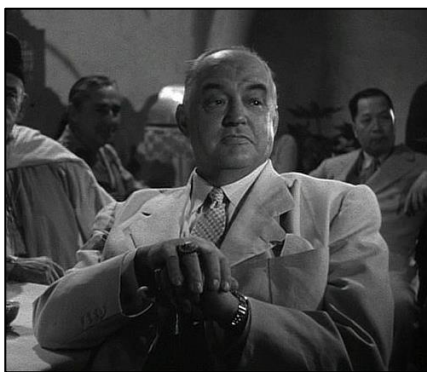
Sydney Greenstreet, as “Señor Ferrari” in Casablanca