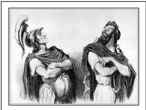
"And what do I care about your Troy!" plate one from Physionomies Tragiques (1851) by Honoré Victorin Daumier

... I thought: Suppose, suppose just once, once, in all these centuries, the slippery gods keep their word and Achilles is granted eternal glory in return for his early death under the walls of Troy ...? What will they make of us, the people of those unimaginably distant times? One thing I do know: they won't want the brutal reality of conquest and slavery. They won't want to be told about the massacres of men and boys, the enslavement of women and girls. They won't want to know we were living in a rape camp. No, they'll go for something altogether softer. A love story, perhaps? I just hope they manage to work out who the lovers were.