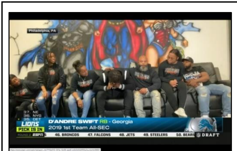
Superhero Wall Mural at the Swift Fit Gym (Philadelphia PA)

- screen shot of ESPN’s coverage of the announcement of the NFL Detroit Lions draft pick - (April 24, 2020)