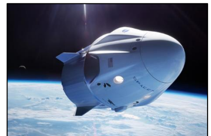
SpaceX’s Crew Dragon Capsule