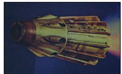
Doctor Zarkov’s Spacecraft