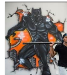
← another wall mural from the Swift Fit Gym

- screen shot of ESPN’s coverage of the announcement of the NFL Detroit Lions draft pick - (April 24, 2020)