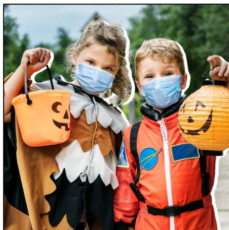
The faces of Halloween 2020?