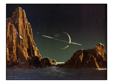
Saturn Viewed from Titan by Chesley Bonestell