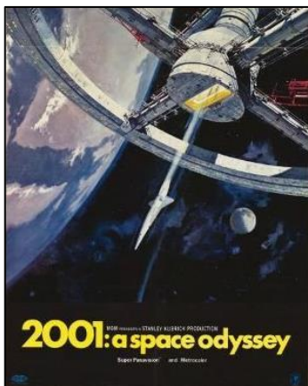
For comparison, here's a poster featuring 2001's space station.