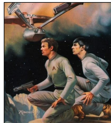
Star Trek: The Motion Picture illustration by Rowena

Interesting side note: After the fall of Saddam Hussein in Iraq, a couple of paintings were found hanging in one of his houses that appeared to be her work ( King Dragon and Shadows Out of Hell ). However, according to Morrill, they were copies – she had sold the originals to a Japanese collector.