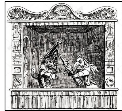
Punch and Judy (after illustr. by George Cruikshank)

Just for the heck of it, I pulled this one out of my library. (It seemed a good time to read it.) Although the word “trickster” never appears anywhere in it, all of the content clearly demonstrates that Punch is part of the long and venerable Trickster tradition. Here’s a short excerpt from the Foreword: