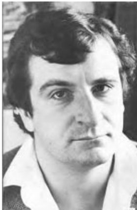
DOUGLAS ADAMS 1952 - 2001

Douglas Adams passed away on May 11, in Santa Barbara, CA, after a heart attack, aged 49. There's undoubtedly a new star somewhere in the firmament.