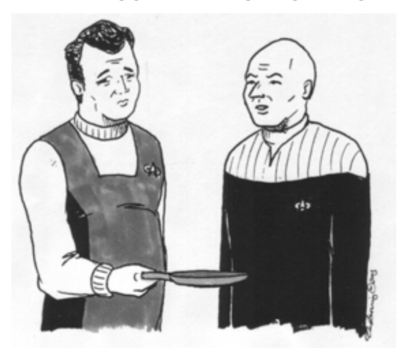
"We have to go back and stop a man named Rick Berman from destroying our franchise! Millions of fans are at stake!!!"

can be science fiction, as in "Amea Amaau," a place where the population is constantly on the move, so no one ever spends more than a day in that city. Or a fantasy tone might be stronger, as in "Ahavah," a utopian city for hoboes that no one seems able to place on a map. There are even touches of Lovecraftian horror, as in "The Cities of Myrkhyr," which literally grows from the plains, but holds a dark seed. Many of the stories are too complex to compartmentalize and have wonderful bits of humor, as in the short short "Maxis." How would you feel if that computer simulation city that you let Godzilla roam through was actually populated by real people? It is the reaction of the citizens to "alien intelligence that rules them" that makes this story so interesting and fun.