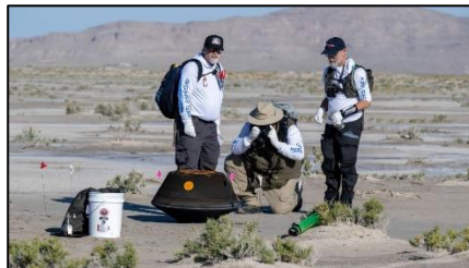
Recovery Team and Capsule

The capsule contained about 8.8 ounces of rubble from the carbon-rich asteroid known as Bennu. NASA's recovery team in Utah included helicopters and a temporary clean room set up on the range. Getting the sample under a "nitrogen purge," as scientists call it, was one of the team's most critical tasks. A continuous nitrogen flow into