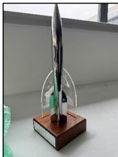
2024 Hugo Award Trophy