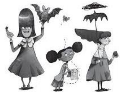
The Porch Sisters (Gertrude, Dee-Dee, & Eugenia) illustration by Alfredo Cáceres