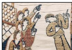
ISTI MIRANT STELLA Watching Halley's Comet, 1066 (Bayeux Tapestry)